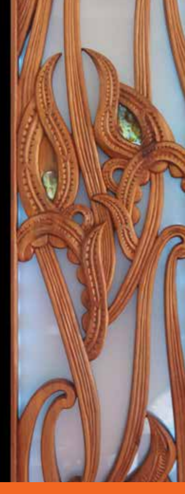
TE TARO O TE ORA The Bread of Life