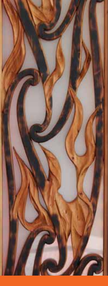
TE MARAMA O TE AO The Light of the World